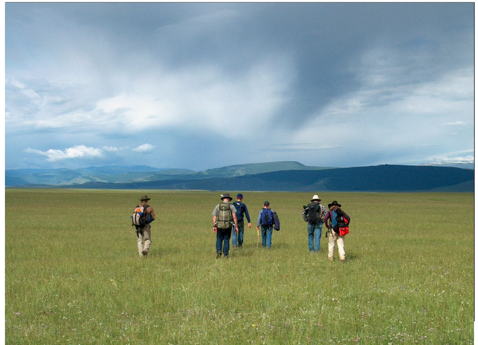
BioRegions Students heading out into the field

BioRegions International is a 501c3 nonprofit organization working to “empower the nomadic cultures of Mongolia to survive in a rapidly-changing world.” BioRegions uses a holistic, community-based approach to encourage whole community sustainability based on stewardship of natural and cultural resources. We work in the areas of education, environment, health, and traditional knowledge and skills. We have been working in the Darhad Valley in northern Mongolia since 1998. This high altitude, remote and isolated valley has high poverty levels, a severe climate, and a natural resource base that is suffering from poaching, over grazing and indiscriminant forest harvest.