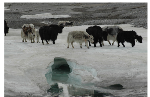
Yaks crossing river in April