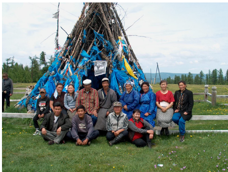
Ovoo at entrance to Darhad Valley