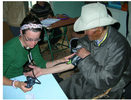
Medical student conducting a health screening