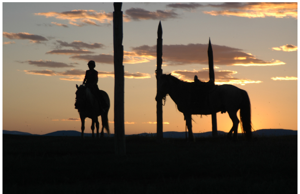
Midnight on Solstice

Participate in promotion, organization, and administration of this event, to be held June 7 in Renchinlumbe. Add