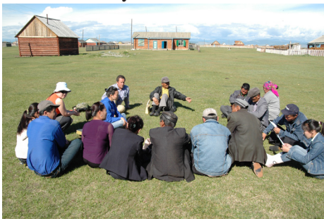
Community meeting with BioRegions trip participants