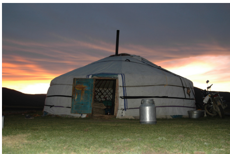
Ger and sunset